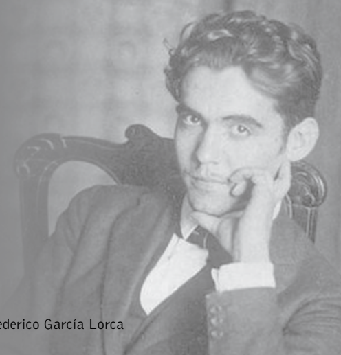
Poet Federico García Lorca

American composer George Crumb (b. 1929) once described the essential acoustic of his music as “a kind of echoing, reverberant acoustic of haunting sounds that cross the river, and bounce between the hills.” Crumb likens this quality to one of the vocal styles used in his 1970 composition, Ancient Voices of Children , as the soprano sings, “a kind of fantastic vocalise into an amplified piano, thereby producing a glimmering aura of echoes.”