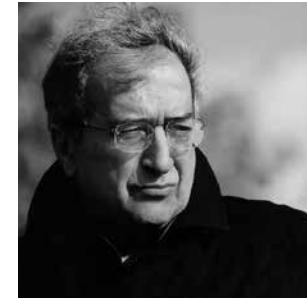
Luciano Berio Arranger of Beatles Songs

George Crumb is one of the most frequently performed composers in today's musical world. He is the winner of both Grammy Awards and Pulitzer Prizes, and continues to compose new scores that enrich the lives of all who come in contact with his profoundly humanistic art. Crumb's music often juxtaposes contrasting musical styles, and many of his works include programmatic, symbolic, mystical, and theatrical elements, which are often reflected in his beautiful and meticulously notated scores. Crumb retired from his teaching position at the University of Pennsylvania in 1997, after more than 30 years of service. He has been honoured by numerous institutions with honorary doctorates, and is the recipient of dozens of awards and prizes.