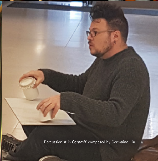
Percussionist in CeramiX composed by Germaine Liu.